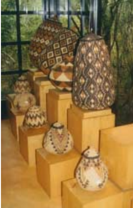
Locally made reed pots from a BEE company, for sale at Phinda