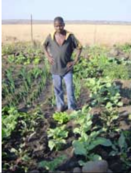
Vegetable Garden & young farmer at the Lillydale Environmental Education Centre