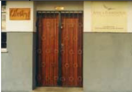
Library (Phinda/Africa Foundation)