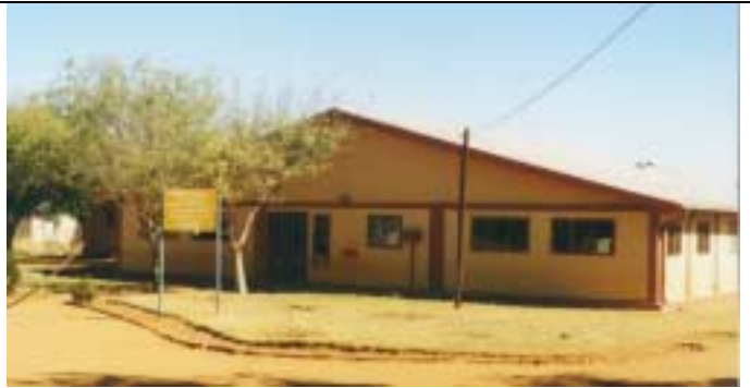
Pre-school (Sun City)