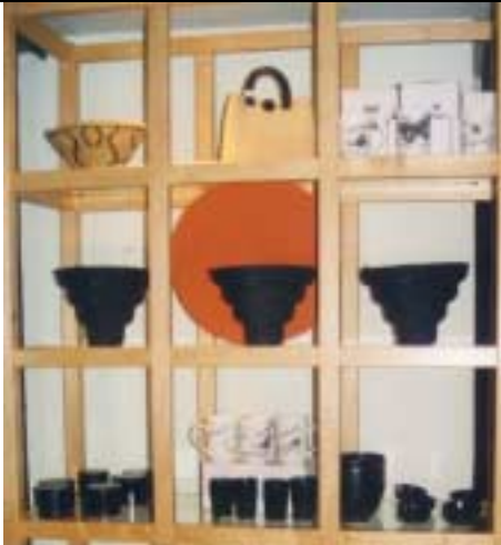
High quality pots from the LOSA initiative, for sale at Phinda