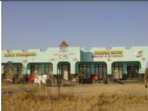
Lillydale Environmental Centre (Sabi Sabi)