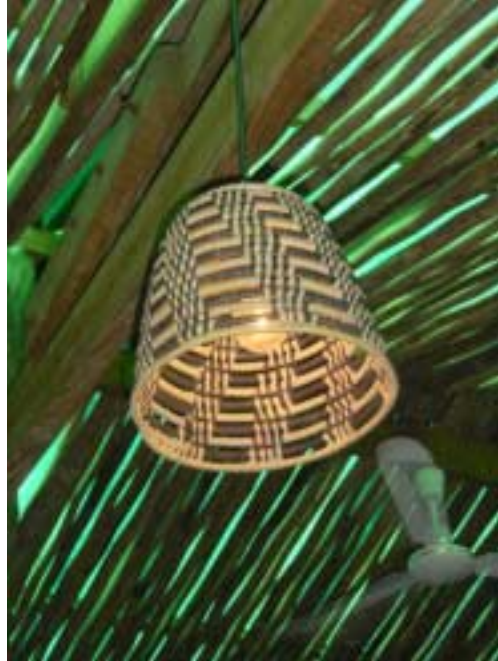
A lampshade made for Coral Divers by local craftswomen